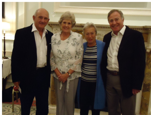
Trophy Runners-up – Coombe Hill Golf Club

In the Plate, the Oxford and St. Georges South opened a weak 2♠ and west doubled. East's response of 2NT seemed an overbid and west, probably expecting more, bid an immediate 6♦ – but fortunately, east's scant values were in the right place. At the other table, south passed and the Oxford & St. Georges west opened 1♦. After hearing a 1♠ response, he rebid 3♥. Quite what this jump reverse meant is not recorded (extra distribution perhaps?) but it convinced east to raise to 4♥. The consequence was that, after a Blackwood enquiry, west chose the wrong slam. 6♥ had no play, even had the trumps broken 4-2, and west duly ended three off – a massive swing of 1670 to Cheeky Chaps.